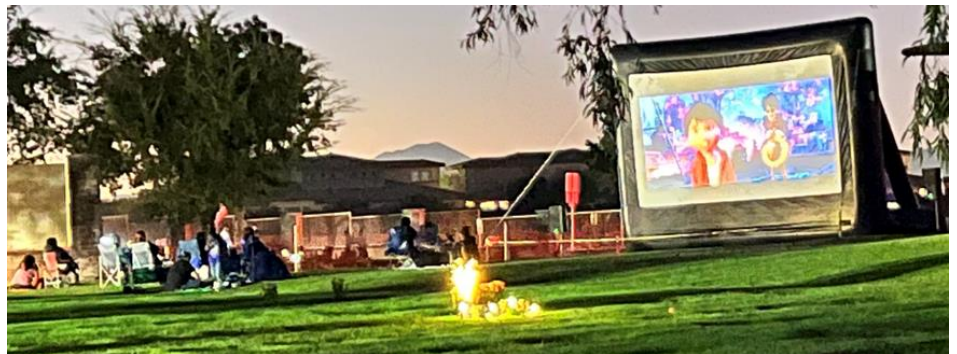
Families gather near the cemetery office on Nov. 1 st for a free outdoor movie.

Niche Flower Cups District offers new way to honor loved ones